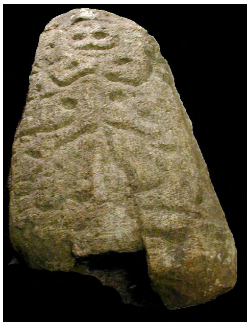
Petroglyph to be displayed in center.

We anticipate that this Interpretive Center will finally fill that need for the central focus point, where new and repeat visitors can be oriented to, or reminded of, why Sweetwater Creek State Conservation Park exists and why that is so important. I hope that you are as proud of this center as we are.