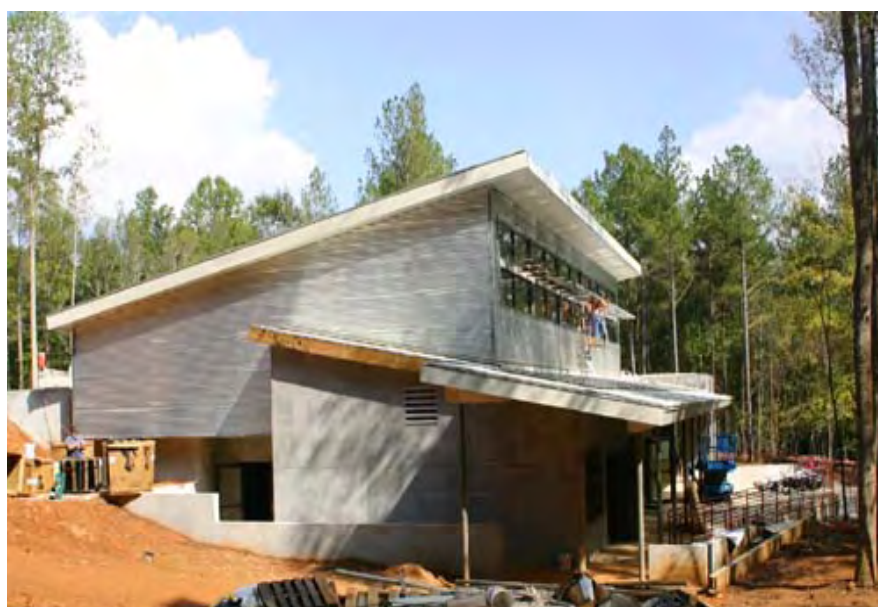
Early picture of construction – You should see it now!